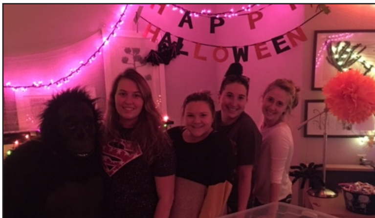
Youth Programs in Appleton and Central Regions got in the swing of Halloween and had some fun!